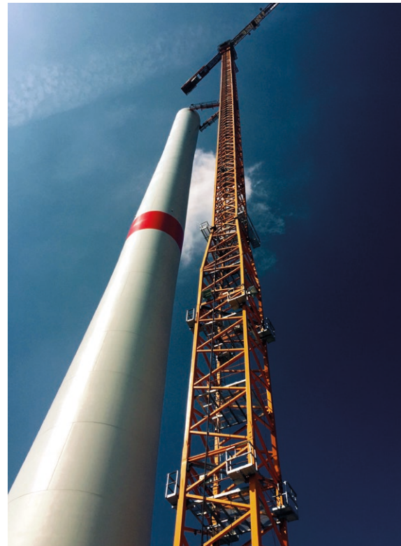
Figure 1 Hybrid tower made of pre-fabricated concrete elements